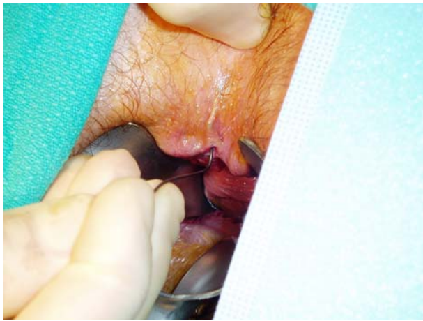
Figure 2. The subcutaneous tract extends approximately 1 cm from the caudad aspect of the fissure and is identified using a narrow-gauge hooked probe, before laying open.

was identified, and therefore, a left-lateral internal sphincterotomy was performed.