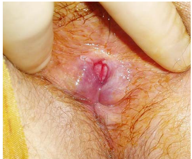
Figure 1. A classic, chronic anal fissure, with indurated edges, and internal sphincter fibers visible in its base.

The second patient (45-year-old female) had a recurrence of posterior fissure symptoms one year after a subcutaneous fissurotomy, and she underwent examination under anesthesia. No subcutaneous tract